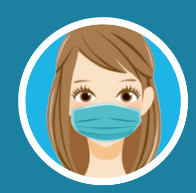
WEAR MASK WHEN